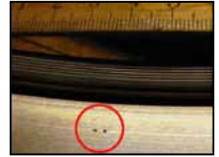
Pittings on outer race way