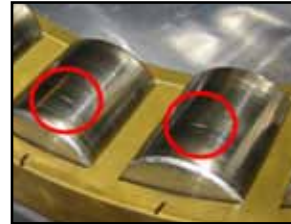
Wear marks on bearing

The inspection confirmed the incipient defects in the roller elements detected by EtaPRO Predictor, as well as pitting in the outer race. Plant personnel replaced the roller elements and race and returned the fan to service where it operated without trouble throughout the peak operating season.